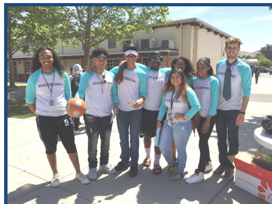
Hercules High School Health Center's Youth Health Workers.